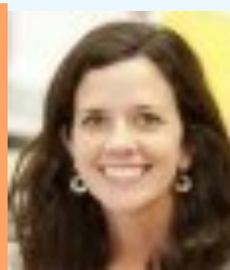
MEGAN STEBBINS LIBRARY/MEDIA